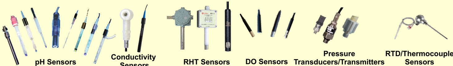
pH Sensors Conductivity Sensors RHT Sensors DO Sensors Pressure Transducers/Transmitters RTD/Thermocouple Sensors

Sensors for pH / Conductivity / RH / DO / Pressure / Temperature