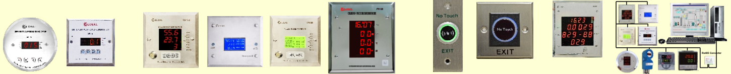
Pressure Indicator Clean Room Monitor No Touch Switch Process Indicator SCADA

Sensors for pH / Conductivity / RH / DO / Pressure / Temperature