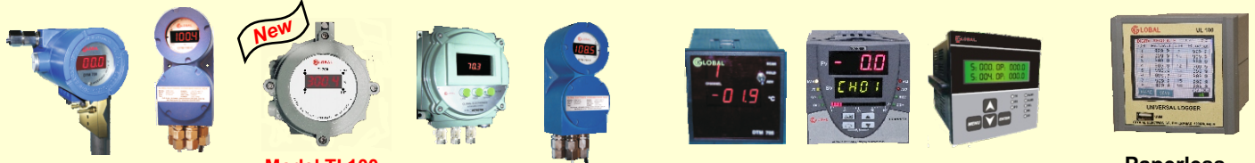
Indicators Model TI 100 Controllers Scanners Paperless Data Loggers

Temperature Indicators / Controllers / Scanners