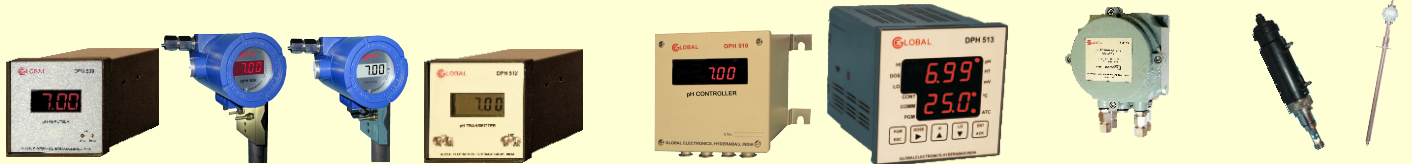
Indicators Controllers Isolators Electrode Holders

Temperature Indicators / Controllers / Scanners